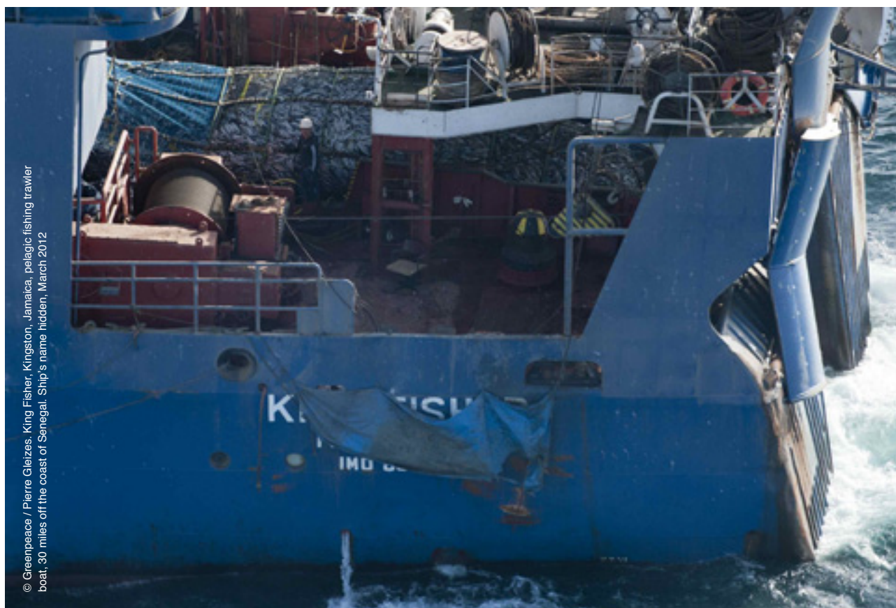
King Fisher, Kingston, Jamaica, pelagic fishing trawler boat, 30 miles off the coast of Senegal. Ship's name hidden, March 2012

In any case, the minister eventually retried to “legalize” the presence of foreign pelagic trawlers in the Senegalese EEZ. As it was definitely impossible to legalize the relevant fishing authorizations, he later attempted to amend the Fisheries Code.